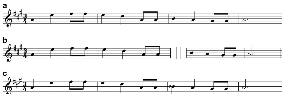
Figure 2 Example of stimuli: (a) a melody with no manipulation; (b) a melody with a temporal anomaly (Off-beat test) and (c) a melody with a pitch anomaly (Scale and Off-key tests).

Self-report of amusic problems is instrumental in research for there is no system to identify amusic cases in the regular curriculum. Here we examined to what extent participants were aware of their musical problem. To the question ‘Do you think that you lack a sense of music?’,